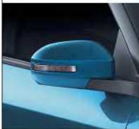
New Pacific Blue