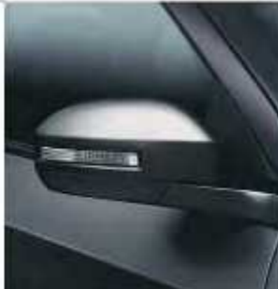
New Glistening Grey

Choose the colour of your desires, from any of these eye-catching colours.